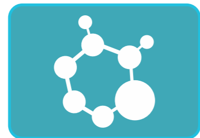
Active Bonding Agents