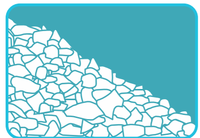
Made from Superior Quality Limestone