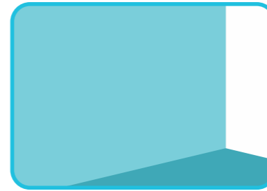
Smooth Matte Finish